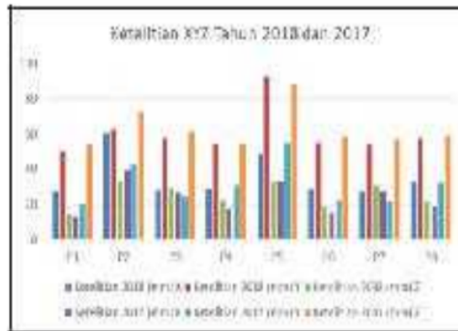
Figure 1. Comparison graphic of XYZ coordinates for 2017 and 2018.

Through GPS – Geogenius Software data processing, the standard deviation value of XYZ in 2017 and 2018 can be known. It is used to see the accuracy of XYZ coordinates every year. Figure 1 depicts comparison of XYZ coordinates for 1 year (2017-2018). Based on figure 1, the highest average accuracy is a P1 point for 2017 and 2018. The lowest average accuracy is P5 for 2017 and 2018. If these are being put for 2017 and 2018, it will be P1, P6, P4, P7, P8, P3, P2, and P5.