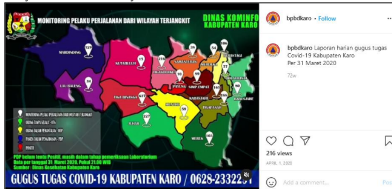
Figure 1 Last post on Instagram @bpbdkaro

This has hampered the dissemination of disaster communication and information to the public. It is necessary to carry out activities to analyze the communication and information dissemination process.