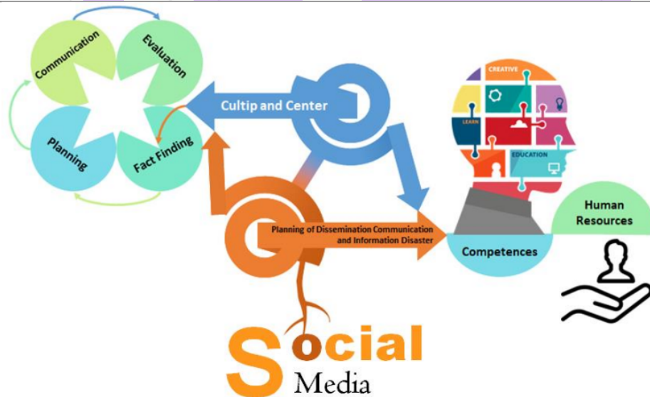
Figure 3 Model of Dissemination Communication and Information Disaster through Social Media

Figure 3 shows that good social media management stems from strong planning. It can be seen that there is a cyclical relationship that is always connected from the communication planning model to the planning for the dissemination of disaster communication and information. Good communication planning is evaluated. This is evidenced by research conducted by Triyandra (2017) which states that the Smart City program planning that has been prepared by the Pekanbaru Communication and Information Office has not been maximized because it has not carried out a formal evaluation. The evaluation should be carried out periodically at a specified time so that the effectiveness of the program is guaranteed. BPBD Karo Regency must periodically evaluate Instagram @bpbdkaro social media, in order to increase the effectiveness of social media for the dissemination of disaster communication and information. It is seen that the importance of evaluation to support the effectiveness of communication planning that improves organizational communication.