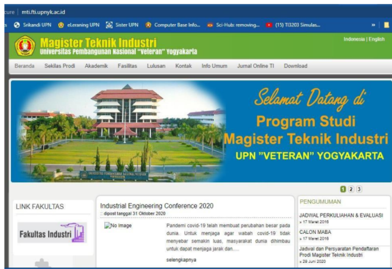
Figure1. Website MTI UPNVY