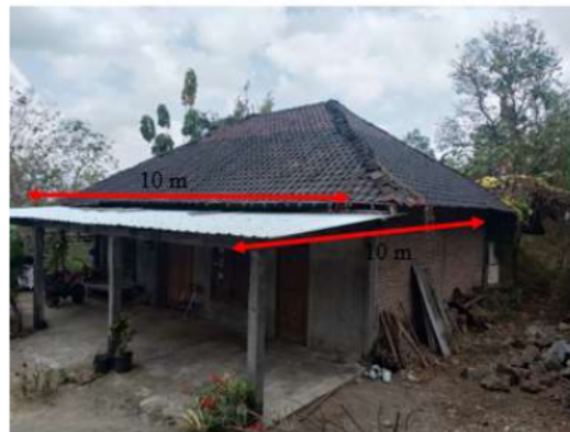
Figure 3. Urban house

rainfall data, the RWH capacity will be calculated to determine the RWH design for each house, consisting of a roof area of 100 m 2 and five family members.