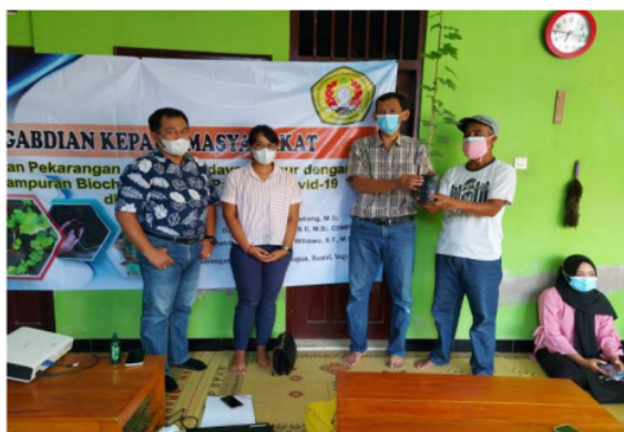
Figure 8. Empowerment of Giving Grape Seeds to Residents of Mayungan Potorono