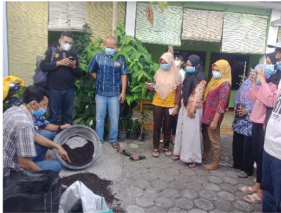
Figure 6. Technique of Media Making by Mixing Coconut Shell Biochar

Factors that affect plant growth consist of internal factors and external factors [19]. Internal factors come from the seeds, seeds, or the plant itself while external factors are factors that come from outside the seeds, seeds, or plants, one of which is the planting medium. Plant media using coconut shell biochar ameliorant is a suitable medium for storing plant nutrients that are applied to narrow land plant cultivation. Biochar material is obtained by burning by pyrolysis on carbon-rich organic materials in the form of twigs and plant roots [20]. The function of carbon in the soil is to bind plant nutrients weakly which when plant nutrients are needed by plants will be released by carbon bonds in the soil [21]. The manufacture of biochar is carried out using a technique owned by the service team with the method of making a rotary sleeve tool that has been patented No. IDS00002403 and can be uploaded openly on YouTube so that people can make media independently. Technical guidance can be accessed via the URL https://www.youtube.com/watch?v=70I4pG275ek [10].