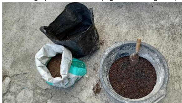
Figure 5. Materials Needed

The people of RT 04 and 05 of Dusun Mayungan really welcomed this program well. Implementation of the Community Service (PbM) program while still complying with health protocols, first officers and community service managers starting with washing hands and checking temperature and wearing masks and keeping a distance to avoid the covid 19 pandemic. narrow can produce high economic value. Understanding and technical knowledge of making a mixture of media where grapes grow is a major part of cultivating plants in a narrow yard of land. The adequacy of plant nutrients in the root complex area is one indicator of plant growth and development for production. The more adequacy of nutrients in the planting medium that is sustainable will provide good grape growth. Correct and good planting media technique by adding ameliorant material in the form of coconut shell biochar is an alternative method of storing nutrients provided through plant fertilization (Figure 5 and Figure 6).