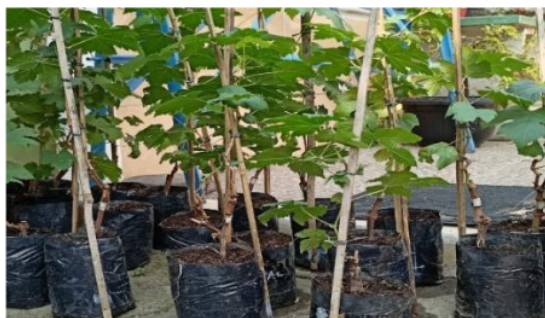
Figure 7. Grape Seeds for Yard Utilization in the Covid-19 Pandemic in Mayungan Potorono Hamlet