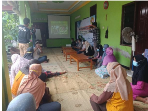
Figure 4. Lecture Session on the Yard Utilization Program with Grape Cultivation in Mayungan Potorono Banguntapan Hamlet, Yogyakarta