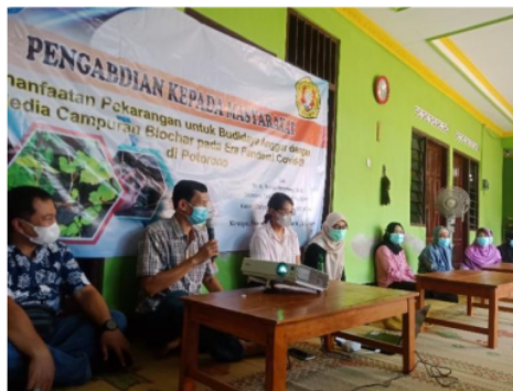
Figure 3. Discussion Session on the Yard Utilization Program with Grape Cultivation in Mayungan Potorono Banguntapan Hamlet, Yogyakarta

Community service activities start from program socialization, program counseling, technical guidance and distribution of grape seeds as well as community assistance. The program implementation was attended by 20 people consisting of RT 04 and 05 Mayungan Potorono hamlet with a sense of pleasure and very welcoming of the program. This can be seen from the seriousness of the participants in participating in the program from beginning to end (Figure 3 and Figure 4) and the timeline of activities is reported in table 1.