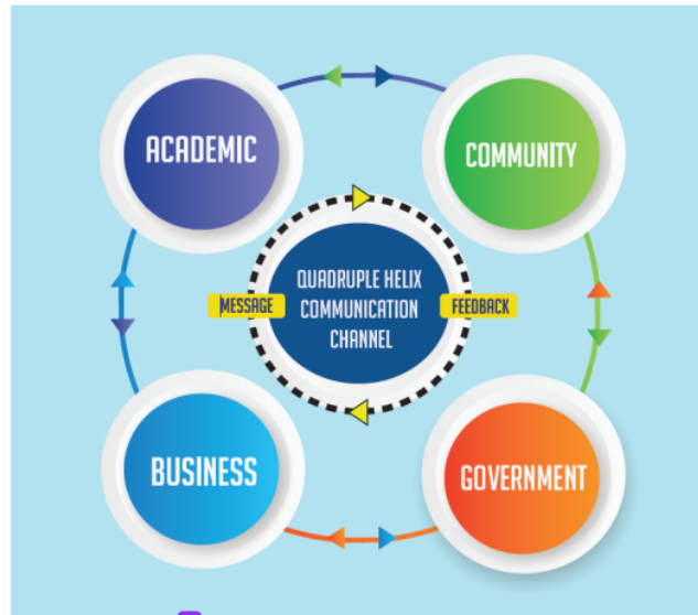
3 Figure 3. Quadruple Helix Communication Model

actors to discuss with four primary purposes: to inform, to consult, to collaborate, and to empower. For the purpose 'to inform' creative actors, one can use one-way communication channels such as emails, newsletters, circulars, and websites. Also, for the purposes 'to consult' and 'to collaborate,' dialogue or two-way communication need to be employed. These channels can be in the form of communication forums, workshops, exhibitions, or focus group discussions. Two-way communication enables each actor to communicate and express ideas, where creativity can grow, and innovation is born. At the same time, it also builds multi reciprocal relationships among creative actors.