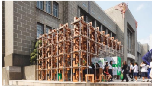
Figure 4: Thailand Creative and Design Center (UNESCO Creative City, 2022)

In the 2013, the TCDC built the first regional design resource centre that has a full slate of services that were formerly only available in Bangkok ( http://www.tcdc.or.th/chiangmai/ visited on June 23, 2015). The central government also enforces this main growth node for northern Thailand through building several key public infrastructures. As already indicated, Bangkok has a vibrant indigenous cultural based economy such as handcraft and fine arts. The city also relies a great deal upon tourism that has a mutual relationship with cityscape beauties. However, the provincial government of Bangkok saw a particular potential in the Information and Technology sector. There are seven universities in Bangkok that could produce IT specialists each year (Theptong, 2010). Some major players in the IT world, like Creative Kingdom and IBM, also have set up their business there. The climate is also suitable for IT related component manufactures (Glassman and Sneddon, 2003).