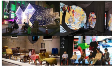
Figure 3: Bangkok Design Week (UNESCO Creative City, 2022)

Bangkok's activities as a creative city include Bangkok Design Week (BKKDW), acts as a multi-collaborative platform to integrate design, art, culture and other disciplines with more than 60 partners and 2000 collaborators from all sectors internationally. The main goals are to disseminate the importance of design as a tool for social and urban development as well as to promote local participation. Furthermore, Bangkok Creative District Network, the act of development multidisciplinary creative hubs that enhances the process of creation-production-dissemination in several areas in Bangkok including Charoenkrung Creative District. The project aims to foster a network of creative districts which will be used as a model for dissemination across Thailand and strengthen the economy both at a community and city level.