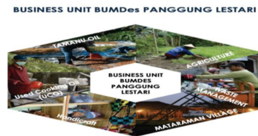
Figure 1. Bussiness Units at BUMDes Panggung Lestari

Bantul Regency is one of the areas that is being intensively formed and developed BUMDes. There are approximately 26 BUMDes in Bantul Regency. BUMDes in Bantul Regency is divided into 3 categories, namely start-up, developing, and advanced. The first category, Start-ups, are constrained by how they find BUMDes managers who have the ability. It develops more on how to manage management, how to organize internal management. BUMDes in the advanced category, namely how the profit obtained is for reinvestment. In this study, BUMDes Panggung Lestari was used as the object of research. According to the previous survey, the Panggungharjo BUMDes are included in the advanced BUMDes amid limited natural resources.