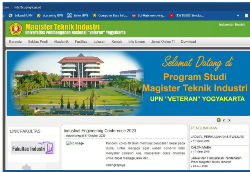
Figure1. Website MTI UPNVY

The method of data collection in this study used the interview and benchmarking methods (comparing with other institutional websites). These two methods are implemented to obtain data about the current condition of the MTI UPNVY website, both internally and externally.