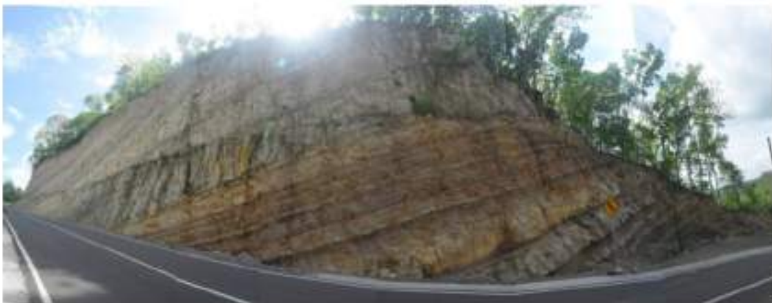
Figure 1. Semilir Formation out-crop in Ngoro-oro Area

Ngoro-oro area is one of the ideal sites to study sedimentology and stratigraphy located in the east of Yogyakarta city. This area covered a Semilir Formation (Rahardjo, 1977). That cropped out very well due to massive excavation (Figure 1). Semilir Formation consists of volcanoclastic sediment such as tuffaceous sandstone, claystone, and lapillus that deposited in deep marine to shallow marine environments. GeoMS software is trying to build a stratigraphic log quickly is through analyzing data until the graphic drawing process. The raw data will be automatically corrected to be fixed data that is used to draw a log. Manipulate and editing the graphic is follow according to user needs.