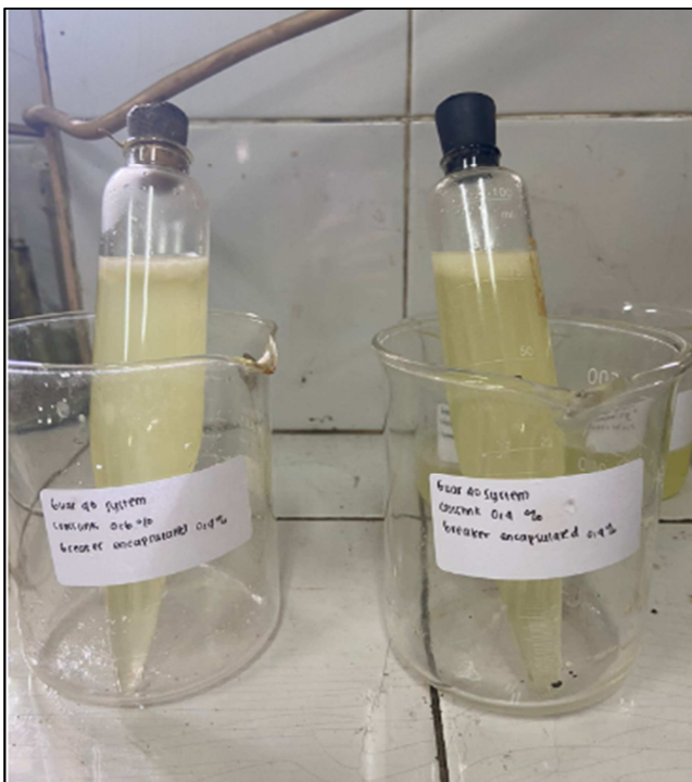
Figure 4. Fracturing fluid after centrifuge.