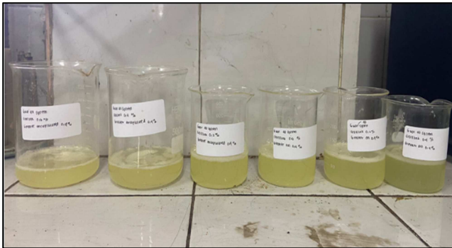
Figure 3. Aged fracturing fluid until breakage.

Figure 3 and Figure 4, shows the separation of residue from the fracturing fluid after it breaks completely. Figure 3 shows the separation process using measuring cup after its keep at room temperature. Figure 4 shows the separation after the fracturing fluid was rotated in the centrifuge. After separation was completed, the residue was filtered by a filter press, and dried using oven. The weighing process is done at wet and dry conditions. Table 5 shows the smallest dry residue produced by fluid type GF-1A of 0.887 gr, but in wet condition type GF-1B has the smallest residue. The highest residue was found in fluid type GF-2C for both wet and dry conditions, 3.96 gr in wet condition and 0.985 gr in dry condition. In general, the residue produced by fluid type GF-1A is less than fluid type GF-1B. The higher the crosslink concentration, the more residues are produced. It can be concluded that 40 system guar gum-based fracturing fluid was compatible with 0.2% of borate crosslinker and 0.4% of oxidizer breaker.