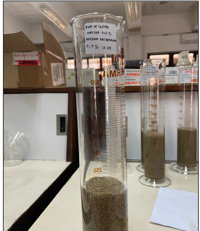
Figure 5. Proppant carrying performance of fracturing fluid.