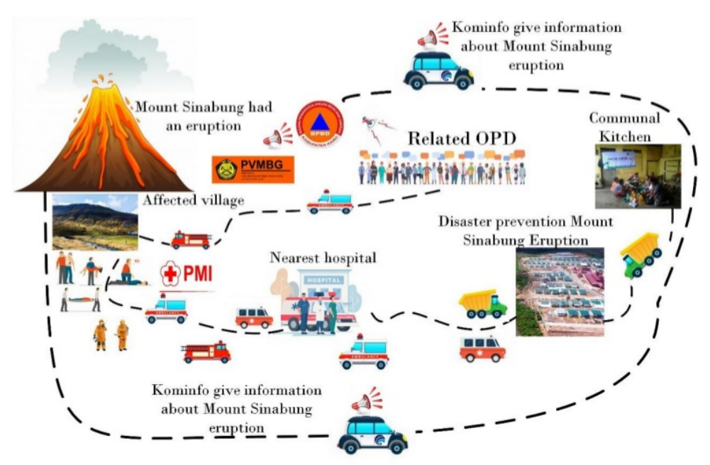
Figure 2: Mount Sinabung Eruption Disaster Communication Model Through Field Simulation Rehearsals

Move 5, which is demobilization, can be seen in table 6. Move 5, which provides information that Mount Sinabung has shown declining activity. PVMBG as the provider of information informs the BPBD. BPBD provides information to the relevant DPOs to get ready for the return of residents to their area of origin as well as the needs needed, stop the public kitchen, and clean the access road to the residents' settlements.