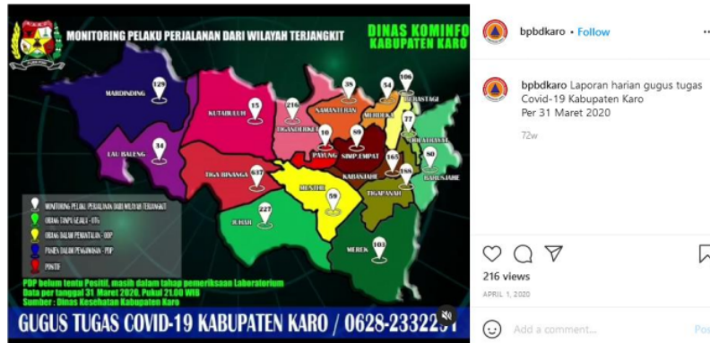
Figure 1 Last post on Instagram @bpbdkaro

The analysis of the communication and information dissemination process from BPBD Karo Regency can be done by using the communication evaluation method. Communication evaluation is needed to check for errors (Nurdin et al., 2014) in the implementation of communication and information dissemination through social media @bpbdkaro. These errors caused a traffic jam in the flow of information so that it had a bad impact on the people of Karo Regency. The community does not get information related to the existing conditions in the Karo Regency area, this causes reduced knowledge for all disasters that occur and their management. The information obtained from the evaluation carried out on social media @bpbdkaro became an improvement in the internal and external information system of the Karo Regency BPBD. The final result of this research evaluation method is in the form of recommendations aimed at BPBD Karo Regency to carry out communication planning, especially in managing Instagram social media.