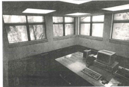
Figure 1. A room with glass windows and no air ventilation (Source: Baumen and Arens, 1988)