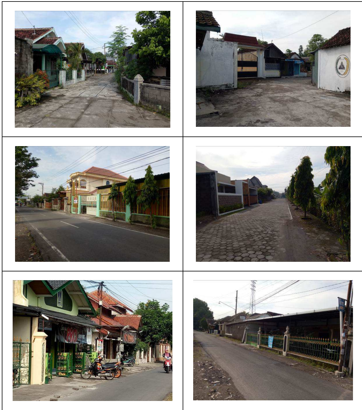
FIGURE 1. Conversion of land use in the region Bedreg, Maguwoharjo

The results of the field observations: obtained illustration/picture on the study site.