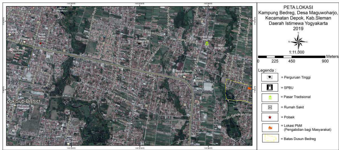
FIGURE 2. Map of the area Bedreg, Village Maguworharjo

Based on the map of the region, can then be the determined area of each land use.