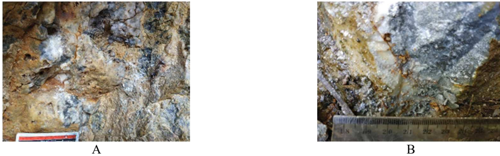
FIGURE 4. A. Brecciated quartz, contains chalcopyrite, galena, sphalerite. B. Banded quartz in comb structure containing pyrite and chalcopyrite mineral.

The silicic, argillic and propylitic alteration in the study area generally have ore minerals carrying gold, silver, zinc and lead in the form of chalcopyrite, sphalerite, galena and pyrite. Based on classification made by White (2009) and Silitoe (2015), the epithermal deposit of the study area can be classified as intermediate sulfidation epithermal deposit for zones with galena and sphalerite mineral particularly on several locations near fault zones and brecciated quartz. Meanwhile, the study area is generally low sulfidation epithermal type deposit.