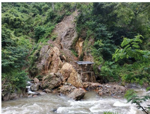
FIGURE 1. The main fault zone in N 330° E direction, is “quartz breccia”.

The geological structures developed in study area are right-lateral strike slip fault in northwest – southeast direction (N 330° E) which is the main fault controlling mineralization in the area and left-lateral strike slip fault in N 030° E direction. Mineral bearing veins were found as quartz veins filling shear joints in N 330° E direction and extension joints in N 005° E direction.