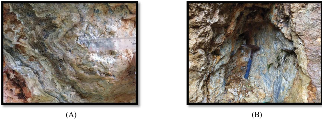
FIGURE 2. Manifestation of silicic alteration (A), argillic alteration (B) propylitic alteration on lithology of andesite lava

Silicic alteration type is indicated by a group of silicic mineral ( \text{SiO}_2 ), such as quartz. The alteration occupies small area which is only 5% of the study area and is generally found in epithermal mineralization system. The silicic alteration found in the study area had strong alteration and could be found in dacite and andesite lava. It was formed in the earliest phase in volatile rich condition and after fluid rich phase, this alteration was exposed to leaching and became vuggy, and even could be brecciated which would open space for deposition of metals brought by hydrothermal fluid. This alteration spreading pattern was influenced by structures developed in the area.