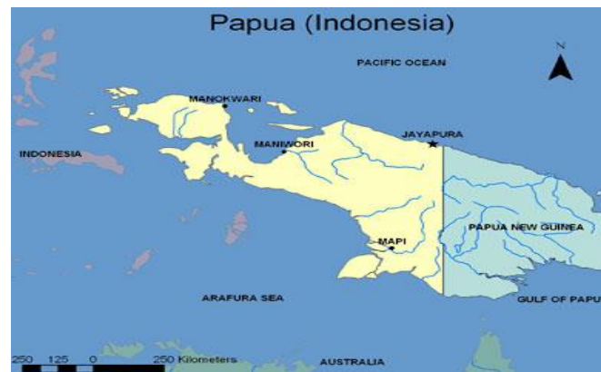
Figure 2- Border between Indonesia-Papua New Guinea