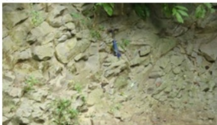
Figure 6. Calcareous claystone Unit of Lidah Formation.

This unit is dominated by calcareous claystone and claystone, massive structure and there are fragments of mollusc shells "Fig. 6". This unit is NN16 to NN18 (Middle Pliocene-Late Pliocene) based on last occurrence of Reticulofenestra pseudumbilicus , Discoaster surculus , Discoaster pentaradiatus , Discoaster brouweri [7]-[11]. This unit was deposited of the inner bathyal to upper bathyal (200-500) meters [12], [13], and the thickness of 170-200 meters.