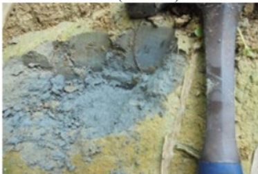
Figure 5. Marl outcrop of Mundu Formation.

This unit is dominated by marl, very thick, massive structure, containing many foraminifera, so it is known as Mundu Marl. Characteristic color of this lithology is bluish-gray and brownish-white "Fig. 5". Stratigraphically it is conformable with calcarenite unit of Ledok Formation. Age of this unit is NN13 to NN16 (Early Pliocene to Middle Pliocene) on the basis of First Occurrence (FO) Discoaster asymmetricus and Last Occurrence (LO) Reticulofenestra pseudumbilicus and Discoaster surculus [7]-[11]. The bathymetry of the unit is upper bathyal to lower bathyal (200-2000) meters [12], [13] while the thickness is (150-200) meters.