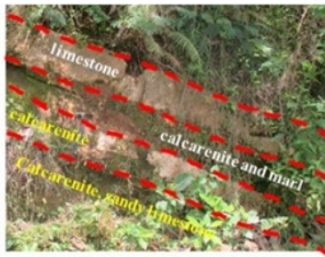
Figure 4. Calcarenite intercalating with limestone, sandy limestone and marl of the Ledok Formation.