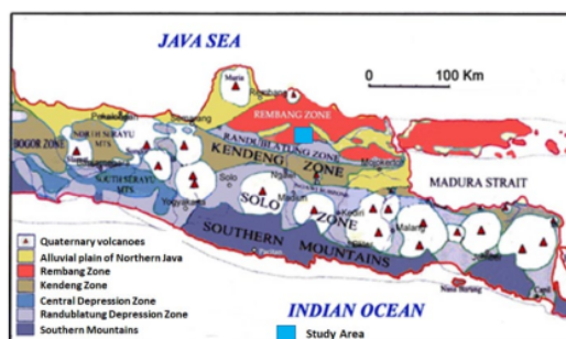
Figure 1. Physiography of East Java Basin [1].

bordered by the Quaternary volcano range (Solo Zone). Kendeng Zone extends from Salatiga in the west to Mojokerto area in the East and drops below the alluvial of the Brantas River, and its continuation can still be followed up below the Madura Strait [1] "Fig. 1".