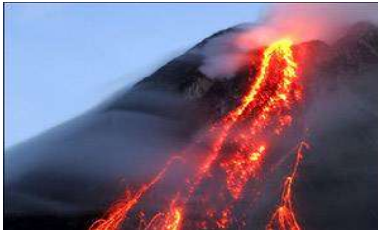
Figure 1. Eruption of Mount Sinabung, 16 September 2013, 18:54 Western of Indonesia Time

happened several times in two locations in it. It can harm the houses in Lau Kawar, Kuto Gugung village and Sigarang-garang village. (5) The height of eruption columns and thundering sound causes the people there panicky, therefore socialization is needed and implemented in Kutanunggal and Payung village. (6) During the increasing activity of Mount Sinabung, Response Team also provided socialization in every village that included in Disaster Prone Area and as area that included as the way of opened-crater (Sukameriah, Simacem, and Bekerah).