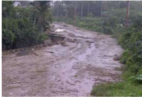
Figure 2. Lahar on 15 November 2013 in Gurukinayan village