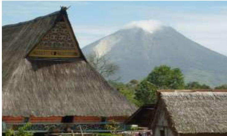
Figure 3. Traditional House of Lingga