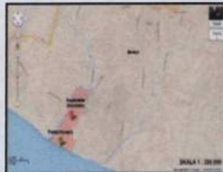
Figure 1. Research area in Srandakan, Bantul, DIY Province

The aim of the project is to design a system to compress and store biogas in such a way that it will be suitable for cooking gas in rural communities. This research is focused on energy conservation area in Srandakan, Bantul, DIY (see fig. 1).