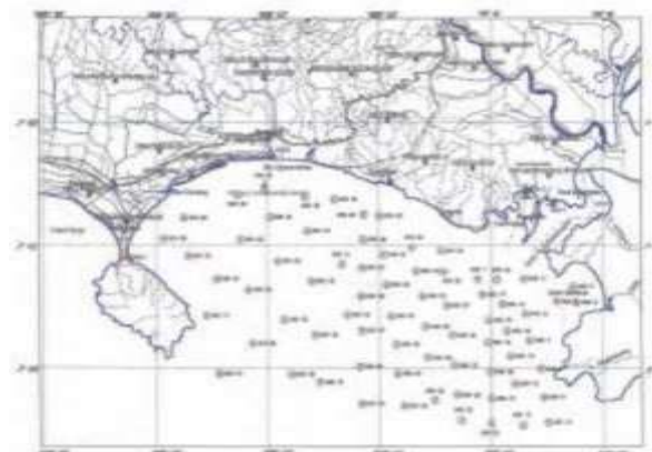
Picture 1. Map of Pangandaran and its surroundings (Sarmili dkk., 2000).