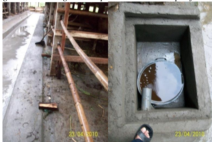
Figure 3. The hygienic communal fence that can divide urine and feces easily