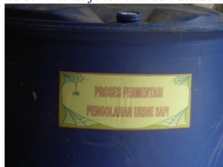
Figure 4. The organic liquid compost